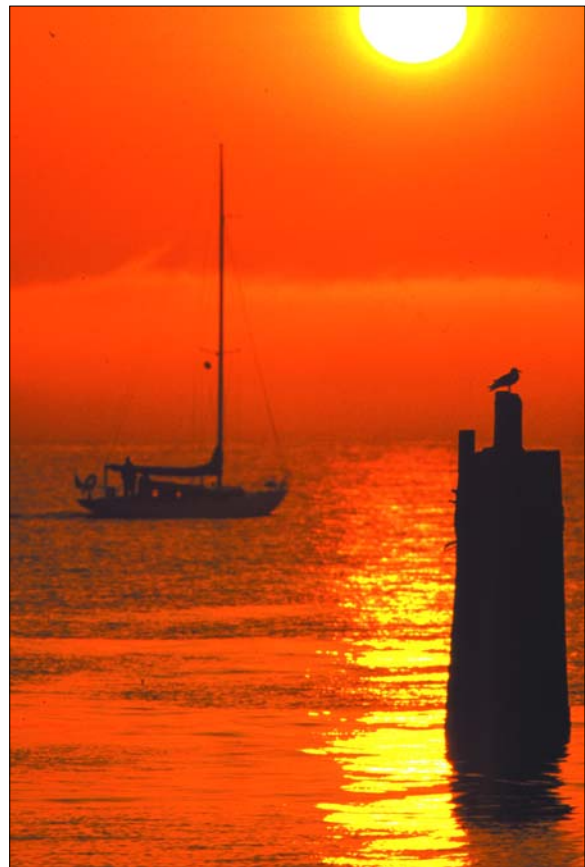
JULY WINNER: SUNSETS AND SUNRISES UNDER SAIL. Canon EOS 3, 70-200 F2.8 lens.