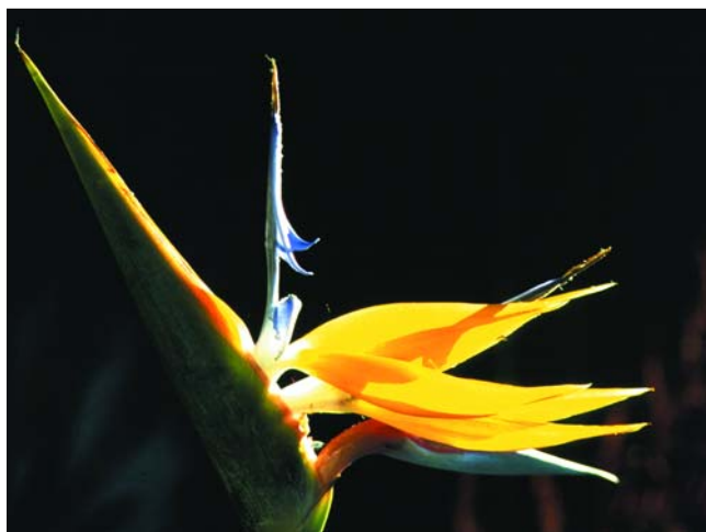
JUNE CERTIFICATE WINNER

UTAH FARM LAND. Canon A-1.