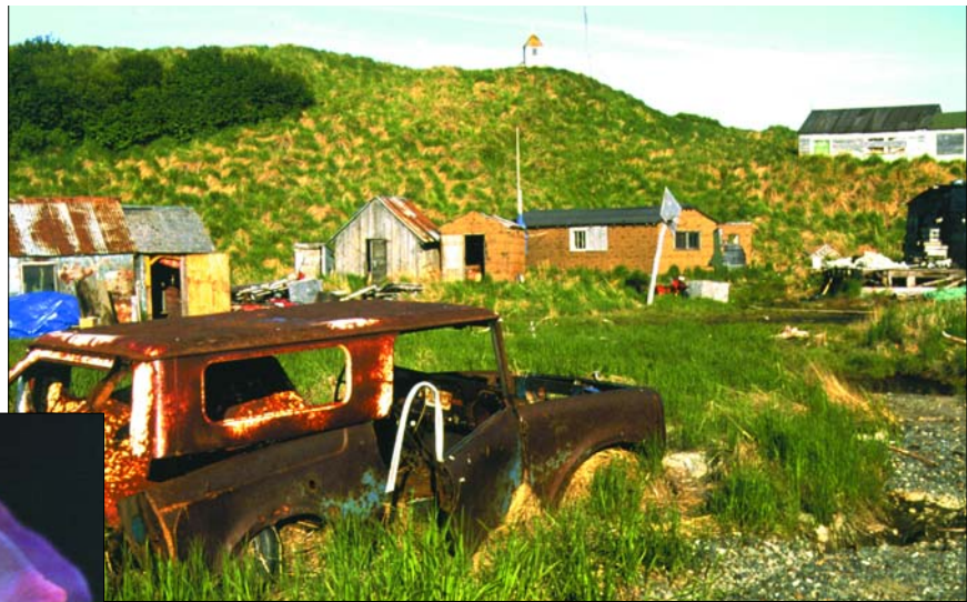
NOVEMBER WINNER: TRAVEL • SCENICS • HIGHWAYS ALASKAN FISHING VILLAGE. Contax RTS-3, Zeiss 28-85mm zoom.