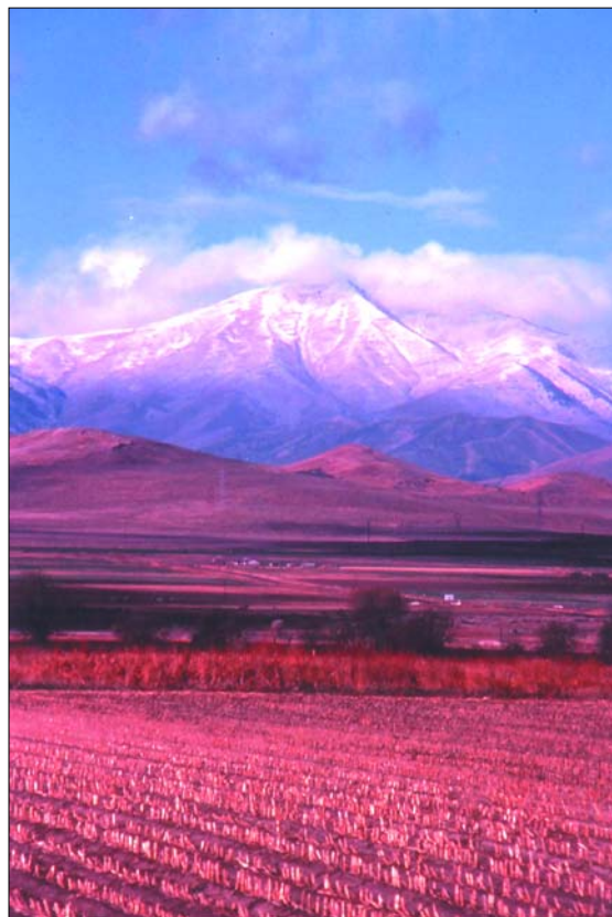
APRIL WINNER: ANYTHING GOES

ALINA - SWEET SIXTEEN. Photo © 2002 by Lyudmila Fedossov IFPO, Skokie, Illinois . N90s, Travelite Studio Lamp. Nikkor 80-200 lens.