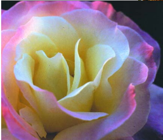
JUNE CERTIFICATE WINNER: ALL SUBJECTS ROSE Photo © 2002 by Thomas Hilliker IFPO, Surprise, . Contax 167, Tokina 80-200, 2.8 21mm Ext. Tube.