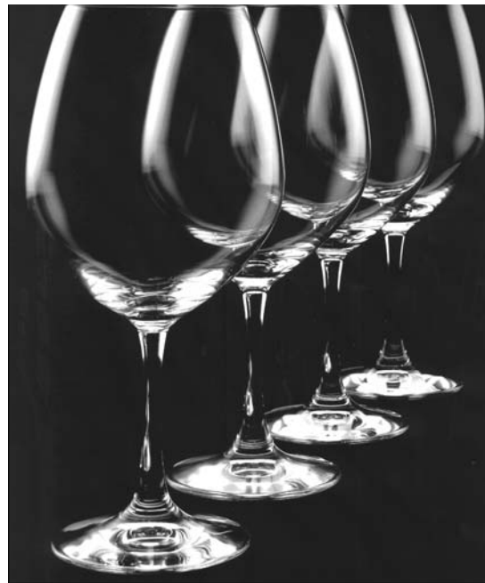
DECEMBER WINNER: ANYTHING GOES (ALL SUBJECTS) WINE GLASSES. Photo © 2002 by Joshua S. Fraser, Santa Barbara, California. Epson 1280 print. Premium Glossy Epson Photo Paper from a 4 x 5 transparency (Fuji Provia 100) scanned on polaroid shot in studio with strobes.