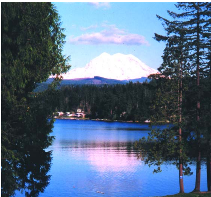
SEPTEMBER WINNER: BEACHES, MOUNTAINS, DESERTS MAJESTIC REFLECTION. Mamiya camera, 200 zoom. KRG 200.