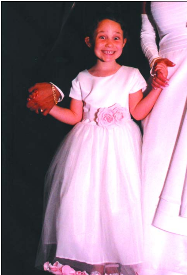
AUGUST HONORABLE MENTION. ANYTHING GOES (ALL SUBJECTS) CONGRATULATIONS. N90s, SB-28, 28-105, Hand held F5.6, S 1/60.