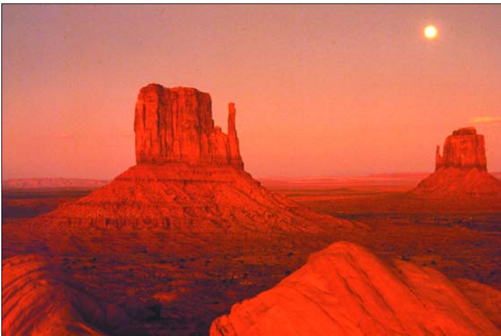
SEPTEMBER CERTIFICATE WINNER: BEACHES • MOUNTAINS • DESERTS MONUMENT VALLEY AT SUNSET. Contax RTS-3, Zeiss 28-85mm zoom.